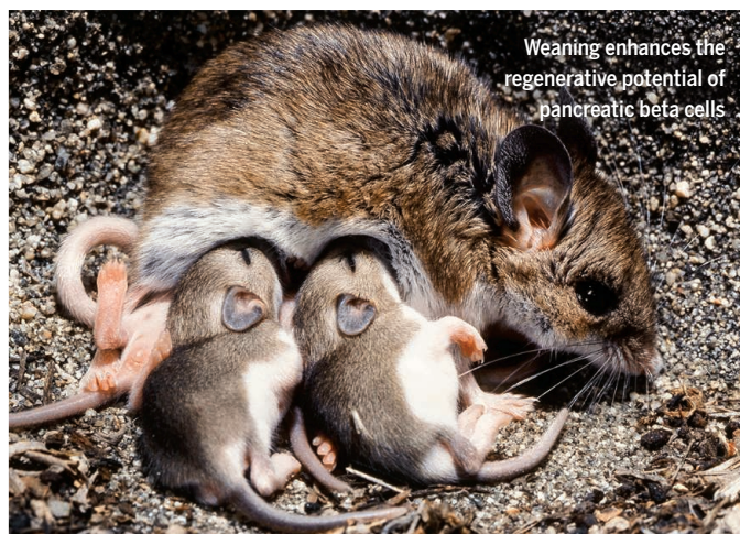
Weaning enhances the regenerative potential of pancreatic beta cells