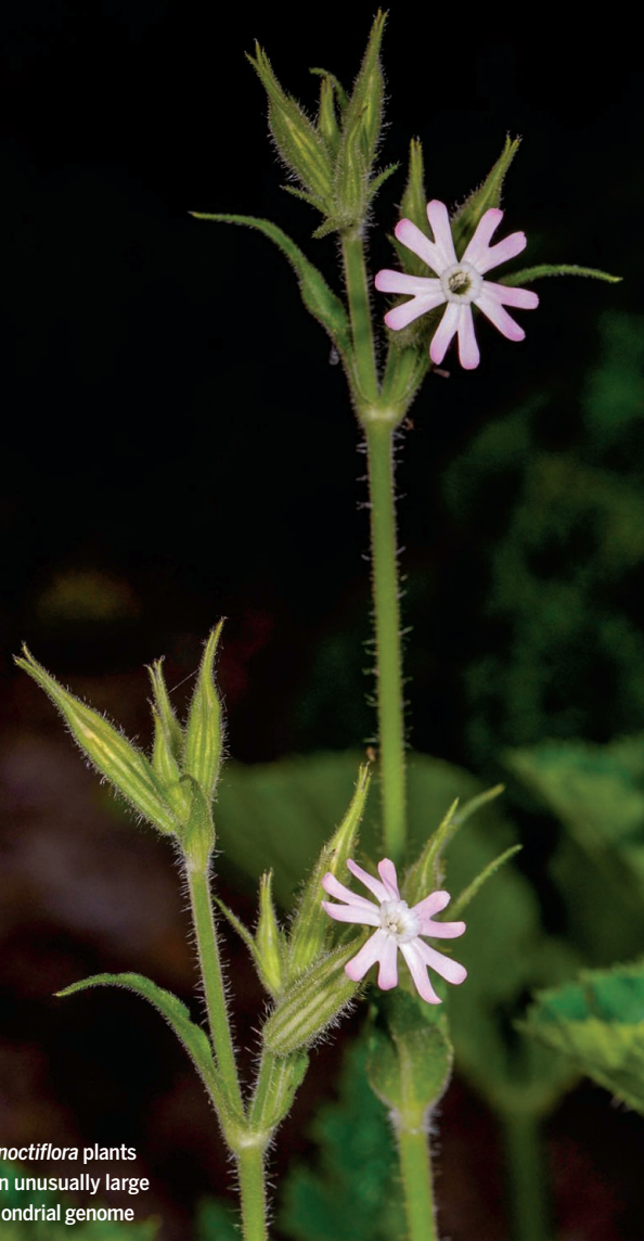
Silene noctiflora plants have an unusually large mitochondrial genome

Proc. Natl. Acad. Sci. U.S.A. 10.1073/pnas.1421397112 (2015).