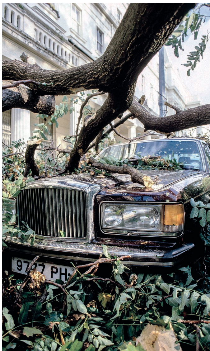
Damage in Hyde Park, London, after the October 1987 storm