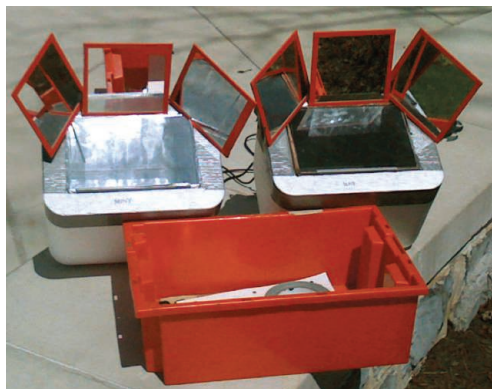
Solar ovens constructed by students. The black one reaches a higher temperature. Both were capable of baking cookies.