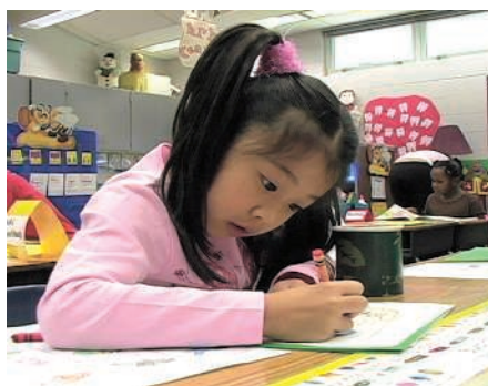
Reading instruction. Lessons are tailored to individual students.

In a previous study, children who began first grade with below-average letter-word reading skills demonstrated greater improvement with greater amounts of time in explicit teacher-managed code-focused instruction (table S1) (16). For students who began with above-average reading skills, greater growth in letter-word reading skills was actually related to less