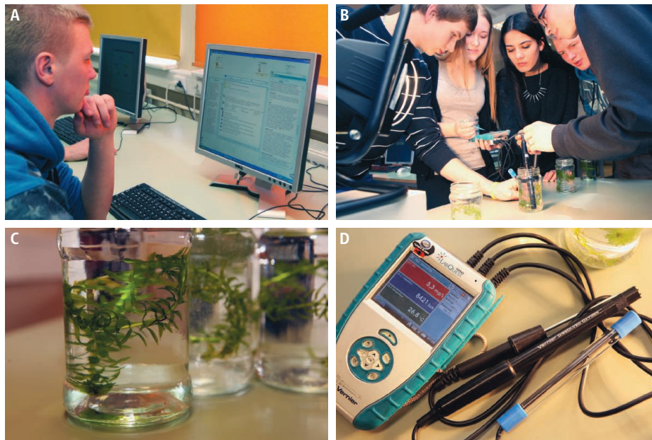
Learning in a SCY mission. (A) A student planning an experiment. (B) Students measuring light intensity and dissolved oxygen level in water. (C) Waterweed in a beaker. (D) Vernier device for measuring dissolved oxygen level.

Students' initial and final revised concept maps were analyzed in order to assess their conceptual knowledge. The results indicated a significant improvement in students' conceptual knowledge (Wilcoxon signed-rank test: Z = -5.92 ; P < 0.001 ). After working with the ECO mission, students were better able to organize and represent their knowledge about relations between biotic and abiotic factors in freshwater ecosystems.