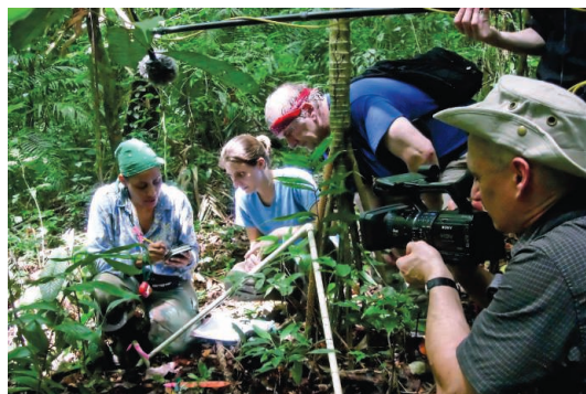
The scientific process is difficult to convey by words alone. A video in The Habitable Planet shows scientists working with the Smithsonian Tropical Research Institute measuring seedlings to study changes in species diversity in the rainforest of Panama.

Online instruction has been part of science educators' professional lexicon for but a few decades, and our understanding of how to use this medium effectively is rapidly changing. One lesson our group has learned is that using this medium to teach for understanding can be extraordinarily difficult. Our foray into this field began with A Private Universe (1), a video famous for its scenes of Harvard graduates struggling with "simple" concepts in science (e.g., the causes of the seasons). This video, together with the online courses we developed as part of the Private Universe Projects in Science (2) and Mathematics (3), demonstrates that, even under the best of circumstances, students all too often fail to adopt the scientific understanding intended by the instructor. Such