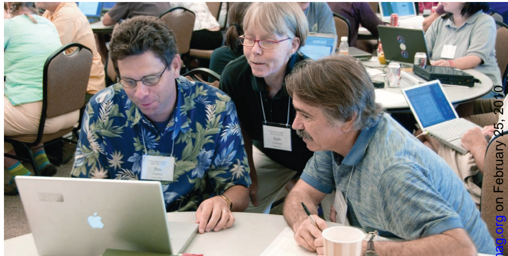
Workshop participants generate much of the Web site content. Here, participants in the 2008 Teaching Introductory Geoscience workshop work together to improve their contributions to the teaching activity collection.

To date, ~1400 geoscience faculty from more than 450